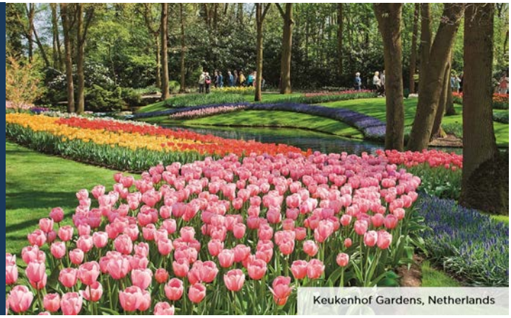
Keukenhof Gardens, Netherlands

7-night cruise from Amsterdam to Amsterdam April 9-16, 2025 | AmaCerto